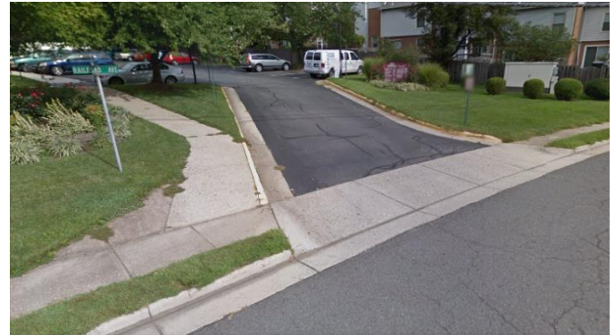
This is the immediate left into Railroad Square